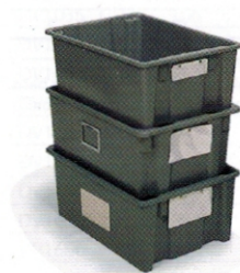
Identification Options (Snap-On and Adhesive Cardholders) (See pg. 39).