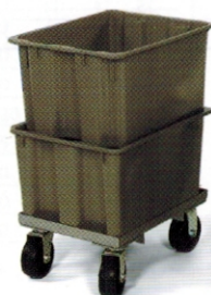
SN2117-12 on DSN2117 Dolly