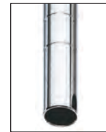
Post for Stem Caster