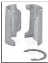
Aluminum Split Sleeve